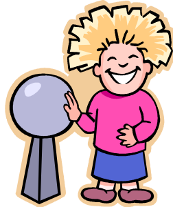
It's that time of year again!

I have personally never used one but I have been told that it works and is available. They aren't too expensive, only around $20.